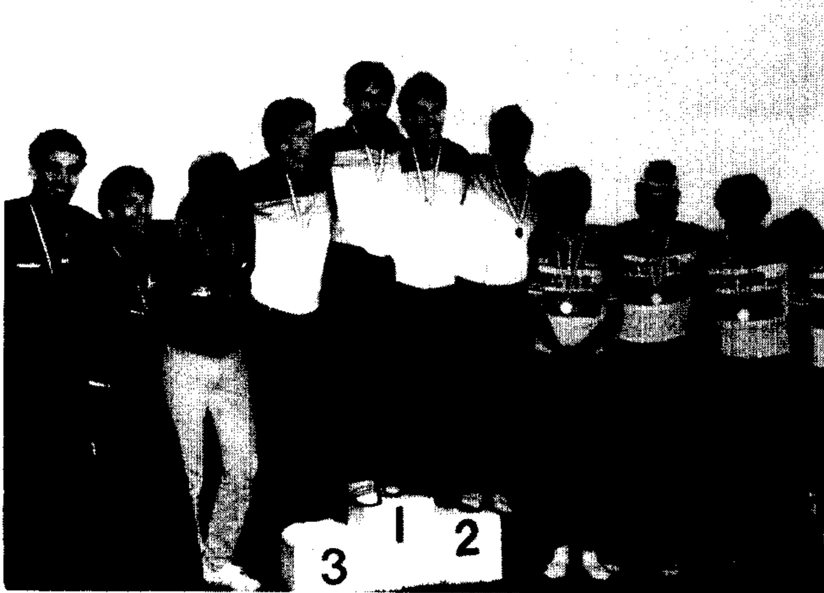
THE FIRST MEDAL PRESENTATION OF THE GAMES FOR THE 50km TEAM TIME TRIAL.

GOLD - ISLE OF MAN SILVER ISLE OF WIGHT BRONZE ANGLESEY